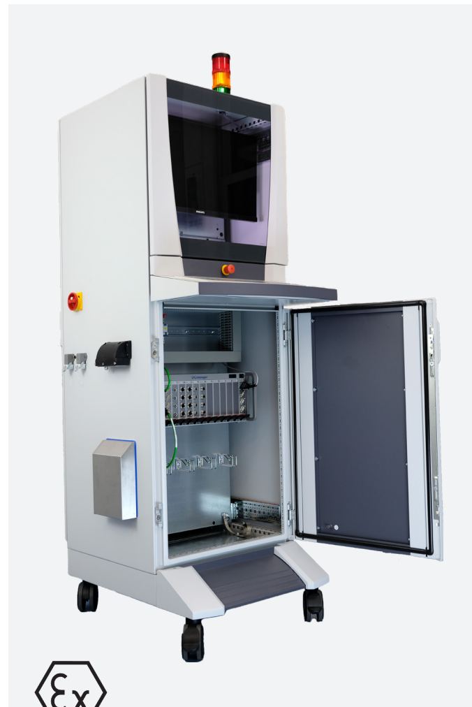
Switch Cabinet TO GO

Our switch cabinet TO GO can be used for example in the chemical, pharmaceutical, bio or food industry.